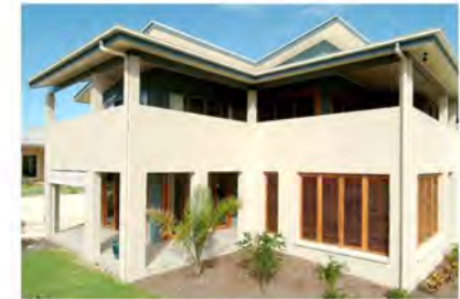
A 5 Bedroom HOME