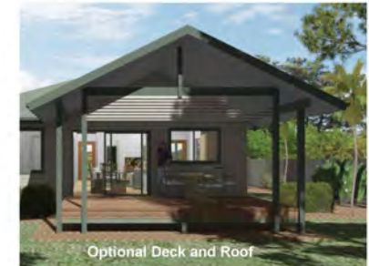
Optional Deck and Roof