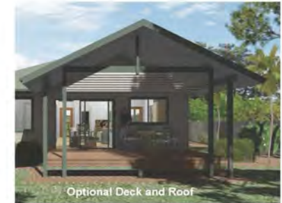
Optional Deck and Roof