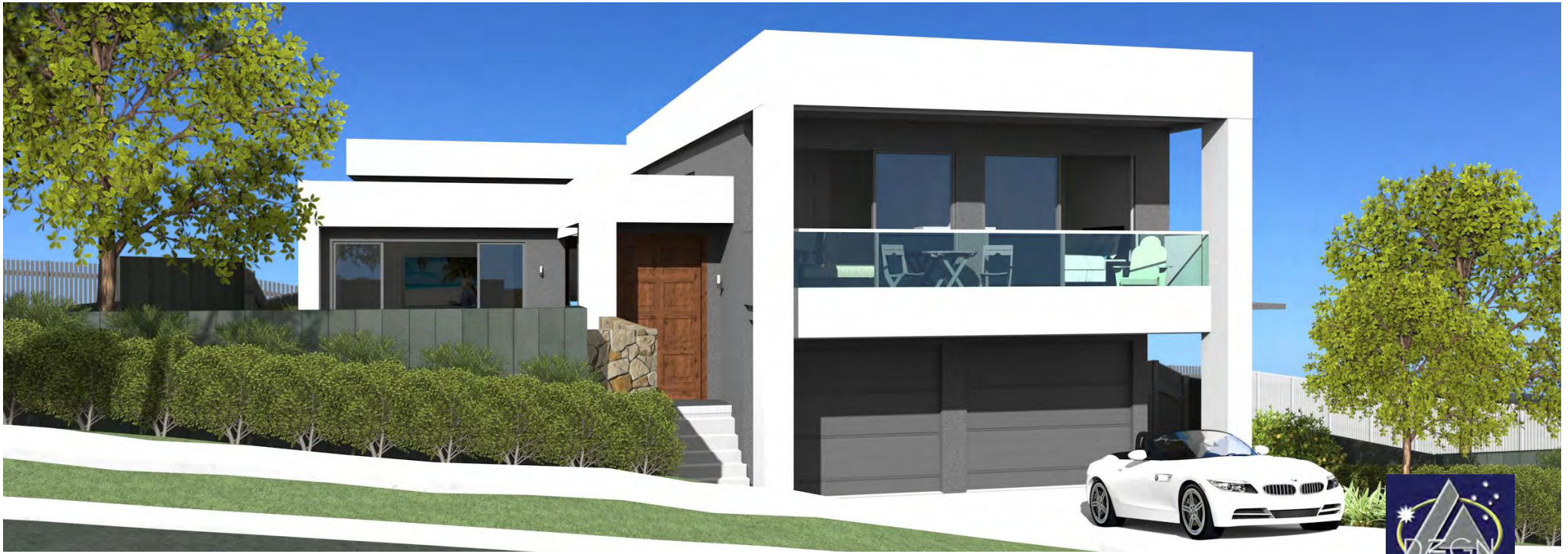
Modern Northerly Design with 2.7m High ceilings