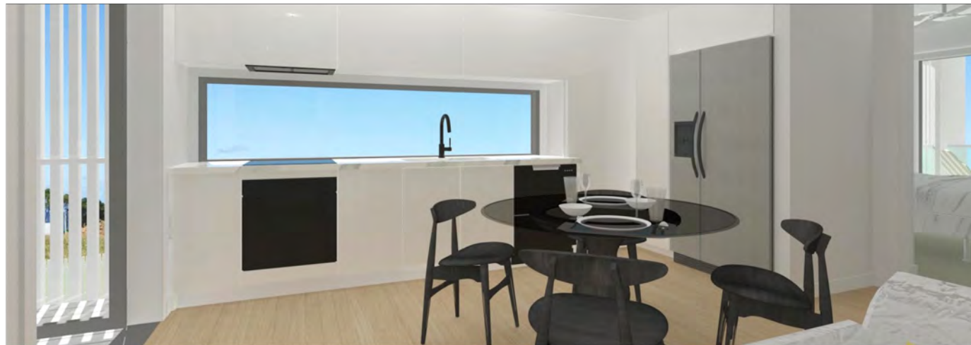
Licence No: 238408C