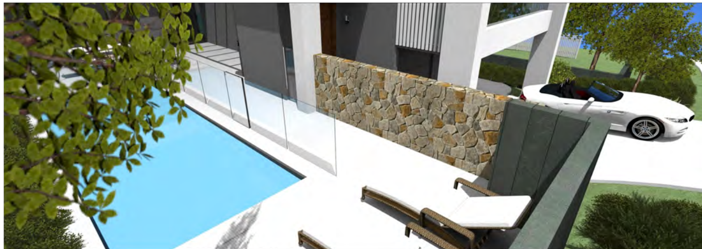
Licence No: 238408C