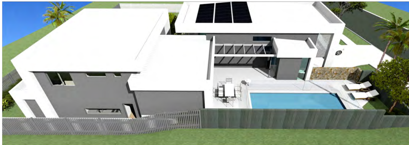
Licence No: 238408C