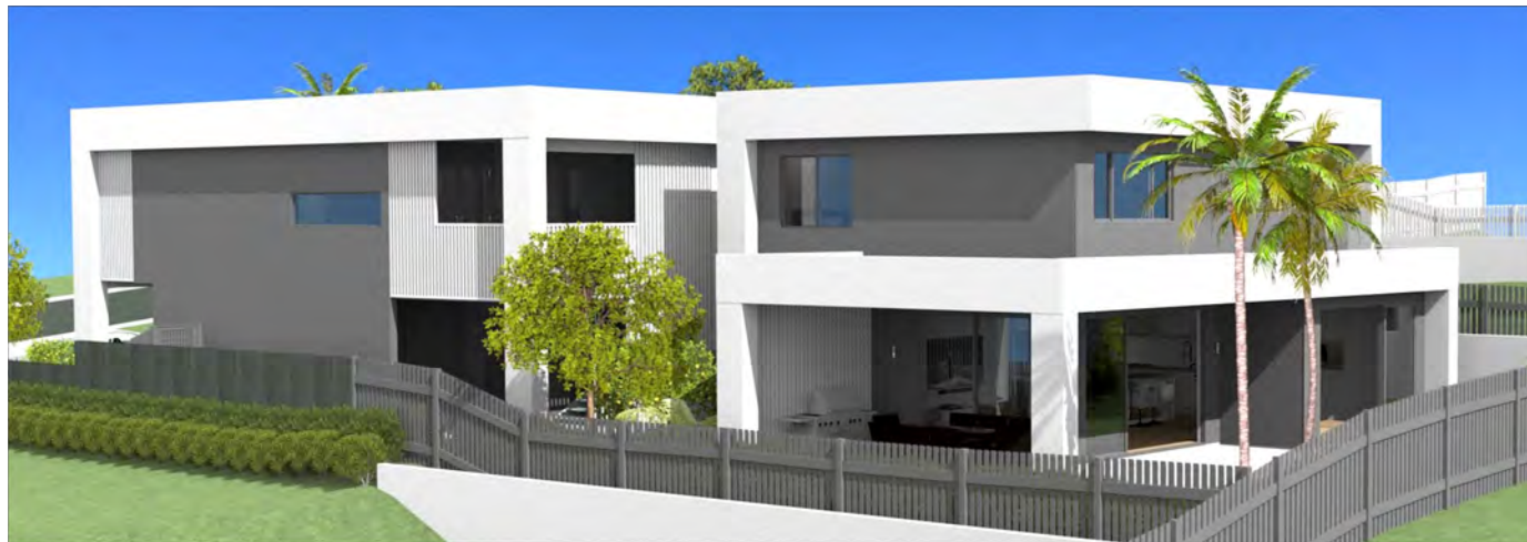
Licence No: 238408C