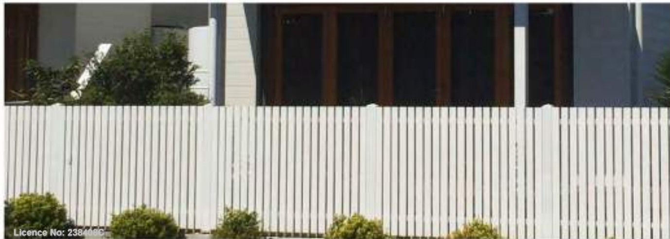
Avalon Model 6.3